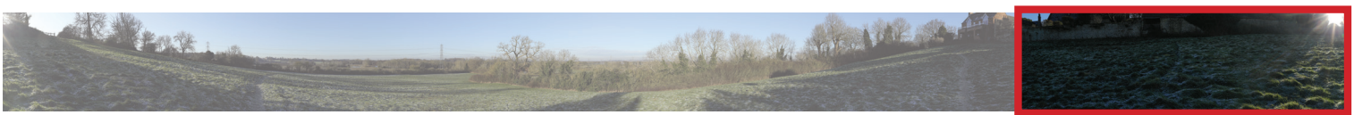
Viewpoint location and extent of view.